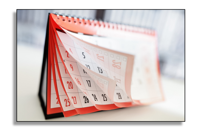
REGULAR PROPERTY INSPECTIONS AND ROUTINE MAINTENANCE CAN SAVE YOU, AND US, THOUSANDS OF DOLLARS!!